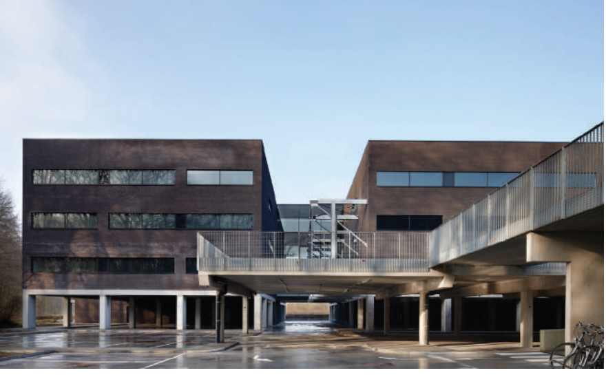
KU LEUVEN- Bio Incubator 2&3